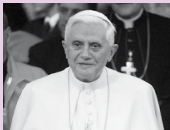
Pope Benedict's address during the New Year's Eve Vespers and Benediction with singing of the Te Deum.

Two different evaluations of the dimension of time thus contrast each other, one qualitative and one quantitative. On the one hand, there is the solar cycle with its rhythms; on the other, that which St. Paul calls the "fullness of time" (Gal 4:4), namely, the culminating moment of the history of the universe and of the human race, when the Son of God was born into the world. The time of promises was fulfilled and, when the pregnancy of Mary had reached its end, "the earth has yielded its increase" (Ps 66 [67]:7) as a psalm says. The coming of the Messiah, foretold by the Prophets, is qualitatively the most important event in all of history, to which it confers its own final and ultimate meaning. Historical-political coordinates do not condition God's choices, but, on the contrary, it is the event of the Incarnation that "fills up" the worth and meaning of history.