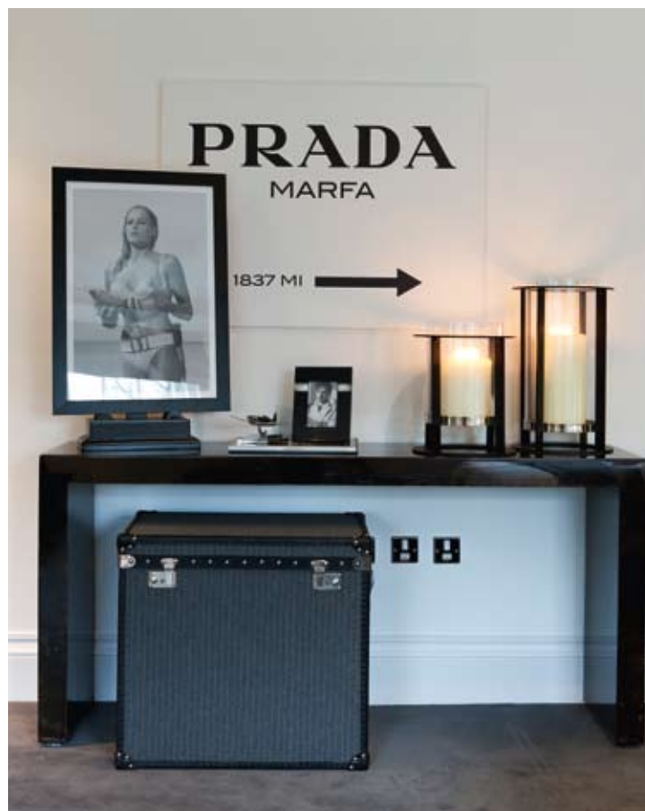
Above: Black furniture creates a masculine feel in this bedroom, while a 'Prada' sign, which Maurizio sourced from a gallery in New York, adds to the tailored-suit theme that inspired the design