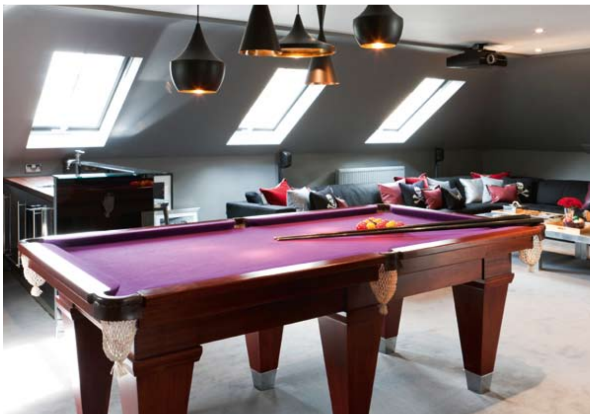
Left: An entertainment room has been created in the loft where a contemporary pool table highlighted by clusters of pendant lights takes centre stage. L-shaped seating in the corner provides comfort for all James's friends

Looking around the finished kitchen-dining space, this was clearly the right decision as the overall aesthetic remains perfectly in harmony with James's brief and the rest of the house. Thanks to some skilful reworking, the room now looks predominantly modern with plenty of warmth and a slightly funky vibe in the dining area where sleek black furniture is teamed with a cowhide rug and cluster of copper lights suspended from the ceiling at various heights.