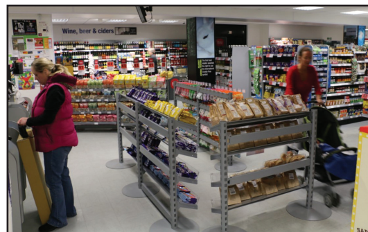
▲ Frome Store

and bacon and sausages from local producer, Downlands Pigs Limited.