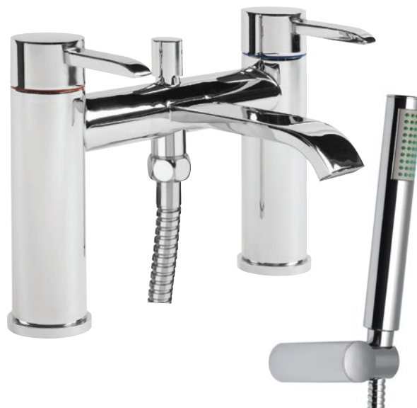
THP42 Bath Shower Mixer & Handset Minimum recommended pressure of 0.5bar 161(h) x 148(d)