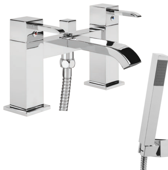
TKC42 Bath Shower Mixer & Handset Minimum recommended pressure of 1.0bar 143(h) x 148(d) £158.92