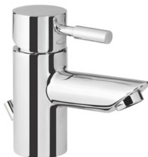
TKN60 Mini Mixer with Pop-Up Waste £88.32

TKN62 Mini Mixer without Pop-up Waste £75.06 Minimum recommended pressure of 0.1bar 120(h) x 126(d)