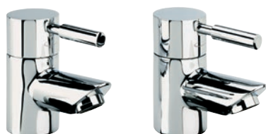
TKN70 Basin Taps (pair) £94.83 Minimum recommended pressure of 0.1bar 93(h) x 110(d)