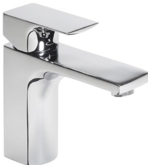
TSN11 Basin Mixer with Click Waste £114.26 Minimum recommended pressure of 0.2bar 167(h) x 165(d)