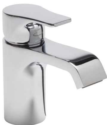
TBL61 Mini Basin Mixer with Click Waste Minimum recommended pressure of 0.2bar 122(h) x 128(d) £107.02