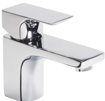
TSN61 Mini Basin Mixer with Click Waste £107.02 Minimum recommended pressure of 0.2bar 128(h) x 151(d)