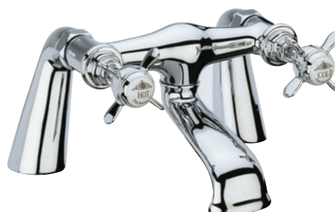
TVA32 Bath Filler £120.72 Minimum recommended pressure of 0.1bar 132(h) x 200(d)