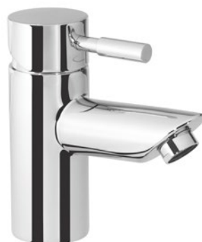
TKN92 Mono Bath Mixer £185.47 Minimum recommended pressure of 0.1bar 167(h) x 166(d)