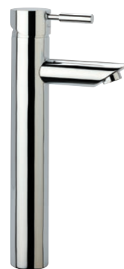
TKN52 Tall Basin Mixer £117.04 Minimum recommended pressure of 0.1bar 314(h) x 150(d)