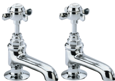
TVA80 Bath Taps (pair) £68.33 Minimum recommended pressure of 0.1bar 127(h) x 125(d)