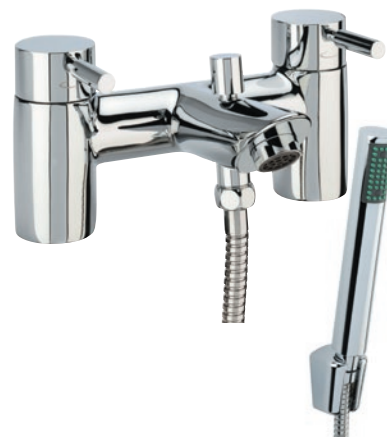
TKN42 Bath Shower Mixer & Handset £168.68 Minimum recommended pressure of 0.1bar 117(h) x 160(d)