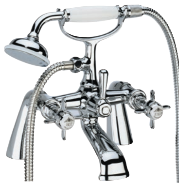
TVA42 Bath Shower Mixer & Handset £203.02 Minimum recommended pressure of 0.1bar 252(h) x 200(d)