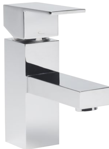
TND11 Basin Mixer with Click Waste £144.32 Minimum recommended pressure of 0.2bar 161(h) x 148(d)