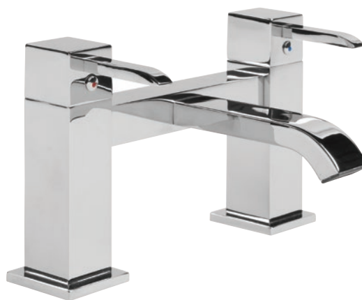
TKC32 Bath Filler Minimum recommended pressure of 0.5bar 143(h) x 148(d) £136.21