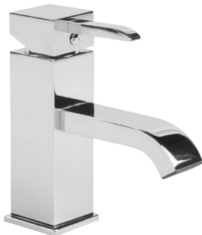
TKC11 Basin Mixer with Click Waste Minimum recommended pressure of 0.3bar 154(h) x 144(d) £95.34