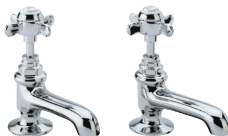
TVA70 Basin Taps (pair) £55.12 Minimum recommended pressure of 0.1bar 123(h) x 125(d)