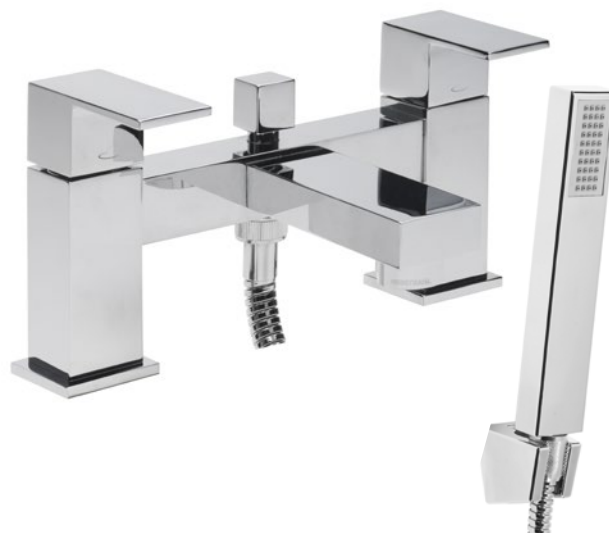
TND42 Bath Shower Mixer & Handset £257.37 Minimum recommended pressure of 0.3bar 123(h) x 138(d)