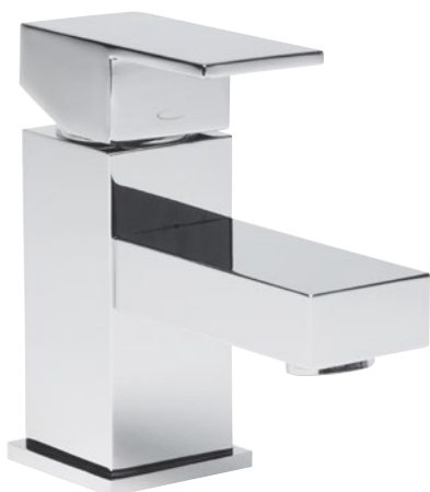
TND61 Mini Basin Mixer with Click Waste £131.09 Minimum recommended pressure of 0.2bar 118(h) x 128(d)