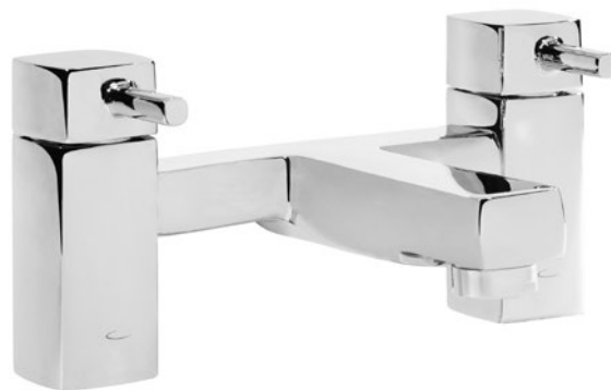
TLG32 Bath Filler £136.09 Minimum recommended pressure of 0.2bar 108(h) x 145(d)