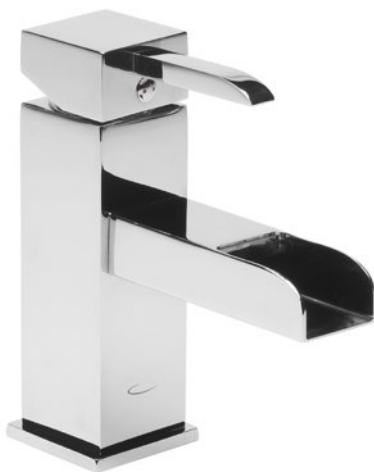
TQ11 Basin Mixer with Click Waste Minimum recommended pressure of 0.5bar 43(w) x 152(h) x 143(d) £118.82