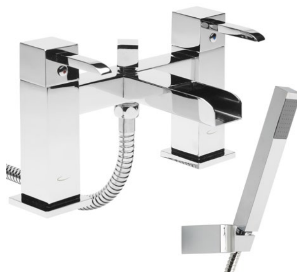
TQ42 Bath Shower Mixer & Handset Minimum recommended pressure of 2.0bar 230(w) x 143(h) x 145(d) £167.39