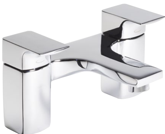
TSN32 Bath Filler £174.38 Minimum recommended pressure of 0.1bar 123(h) x 159(d)