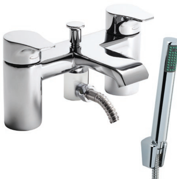
TBL42 Bath Shower Mixer & Handset Minimum recommended pressure of 0.3bar 123(h) x 148(d) £203.25