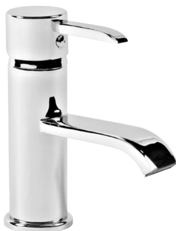
THP11 Basin Mixer with Click Waste Minimum recommended pressure of 0.2bar 153(h) x 135(d)