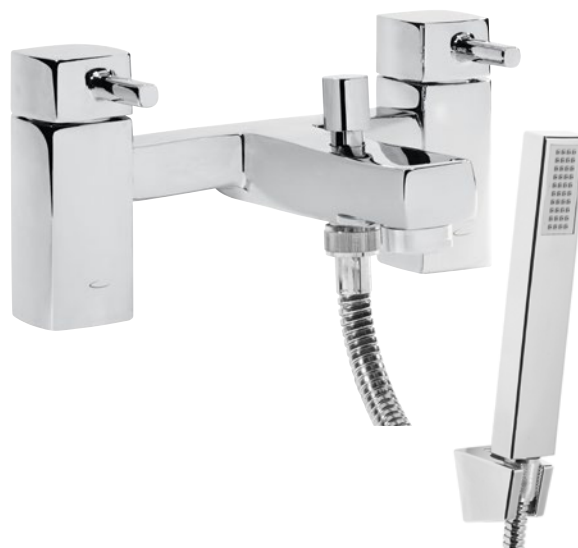
TLG42 Bath Shower Mixer & Handset £160.83 Minimum recommended pressure of 0.2bar 108(h) x 145(d)