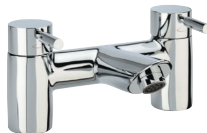
TKN32 Bath Filler £142.17 Minimum recommended pressure of 0.1bar 117(h) x 160(d)