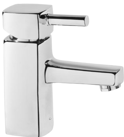
TLG11 Basin Mixer with Click Waste £97.31 Minimum recommended pressure of 0.2bar 143(h) x 95(d)