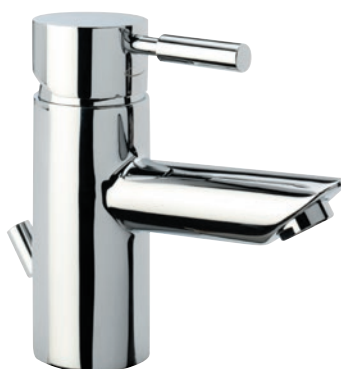
TKN10 Basin Mixer with Pop-Up Waste £93.30

TKN12 Basin Mixer without Pop-Up Waste £80.87 Minimum recommended pressure of 0.1bar 150(h) x 152(d)