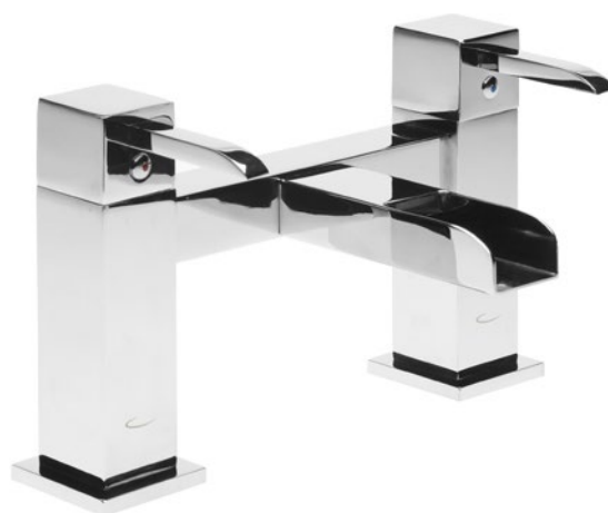
TQ32 Bath Filler Minimum recommended pressure of 1.5bar 230(w) x 143(h) x 145(d) £139.08