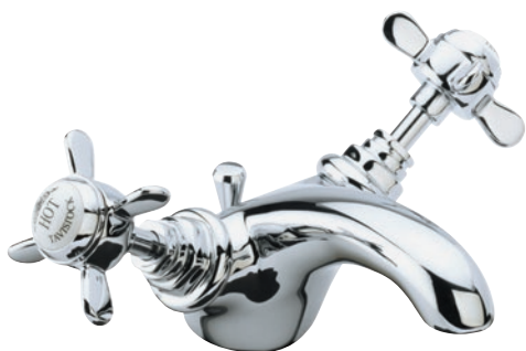
TVA10 Basin Mixer with Pop-Up Waste £94.49 Minimum recommended pressure of 0.1bar 100(h) x 140(d)