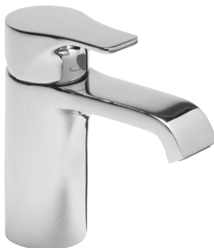
TBL11 Basin Mixer with Click Waste Minimum recommended pressure of 0.2bar 145(h) x 143(d) £114.26