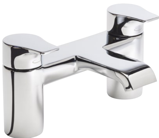
TBL32 Bath Filler Minimum recommended pressure of 0.1bar 123(h) x 148(d) £174.38