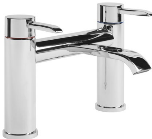
THP32 Bath Filler Minimum recommended pressure of 0.2bar 161(h) x 148(d)