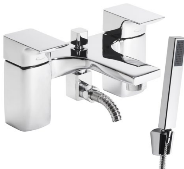
TSN42 Bath Shower Mixer & Handset £203.25 Minimum recommended pressure of 0.3bar 123(h) x 159(d)