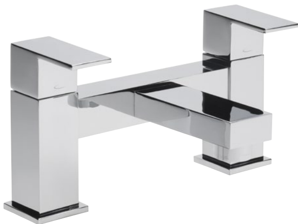
TND32 Bath Filler £220.09 Minimum recommended pressure of 0.1bar 123(h) x 138(d)