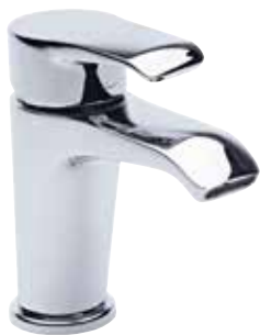
Tier Basin Mixer with Click Waste Minimum recommended pressure 0.3bar 50(w) x 140(h) x 140(d)mm