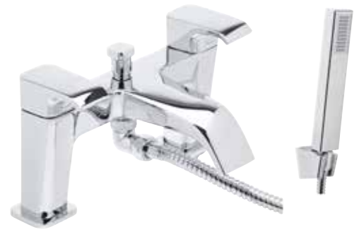
Adapt Bath Shower Mixer & Handset Minimum recommended pressure 0.3bar 230(w) x 130(h) x 160(d)mm