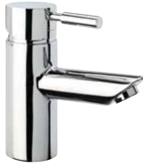
Kinetic Basin Mixer (waste not included) Minimum recommended pressure 0.1bar 150(h) x 152(d)mm