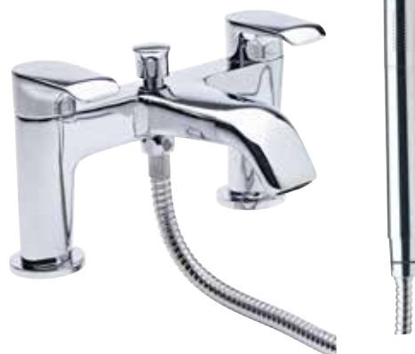
Tier Bath Shower Mixer & Handset Minimum recommended pressure 0.3bar 230(w) x 135(h) x 165(d)mm