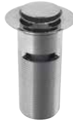
100mm Slotted Click Waste