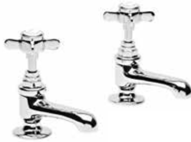
Varsity Basin Taps (pair) Minimum recommended pressure 0.1 bar 123(h) x 125(d)mm