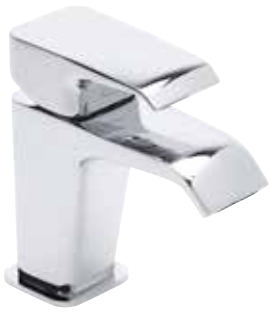
Adapt Basin Mixer with Click Waste Minimum recommended pressure 0.3bar 50(w) x 136(h) x 135(d)mm