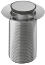
75mm Unslotted Click Waste