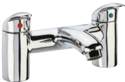
Cruz Bath Filler Minimum recommended pressure 0.1bar 127(h) x 160(d)mm