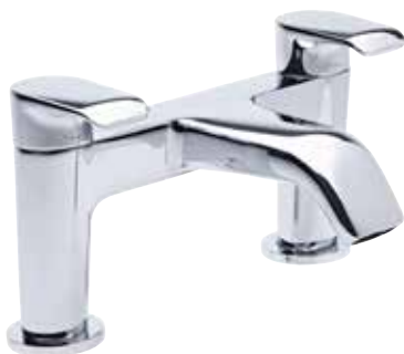
Tier Bath Filler Minimum recommended pressure 0.3bar 230(w) x 135(h) x 165(d)mm