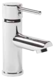
Lift Basin Mixer (waste not included) Minimum recommended pressure 0.2bar 153(h) x 122(d)mm