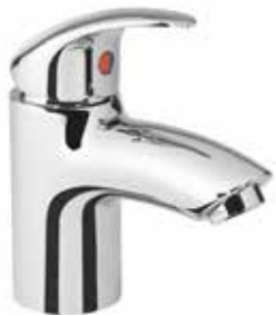
Cruz Mini Basin Mixer (without pop up waste) Minimum recommended pressure 0.2bar 131(h) x 123(d)mm