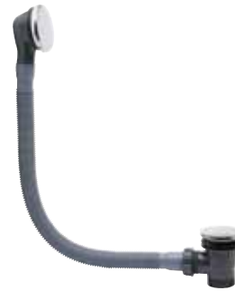
Click Bath Waste & Overflow 670mm hose