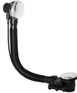
Pop-up Cable Bath Waste & Overflow 670mm hose