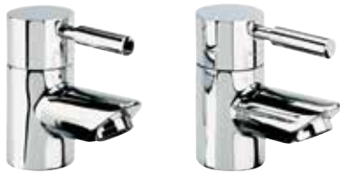
Kinetic Basin Taps (pair) Minimum recommended pressure 0.1bar 93(h) x 110(d)mm