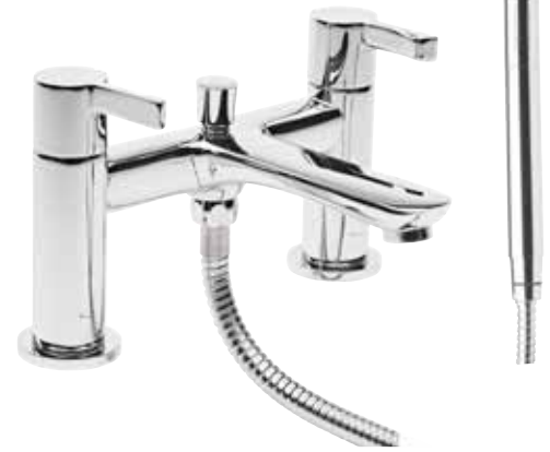
Revive Bath Shower Mixer & Handset Minimum recommended pressure 0.2bar 230(w) x 136(h) x 180(d)mm