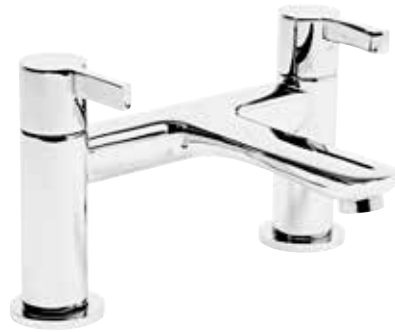
Revive Bath Filler Minimum recommended pressure 0.2bar 240(w) x 170(h) x 180(d)mm