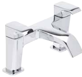
Adapt Bath Filler Minimum recommended pressure 0.3bar 230(w) x 130(h) x 160(d)mm