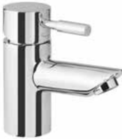
Kinetic Mini Basin Mixer (waste not included) Minimum recommended pressure 0.1bar 120(h) x 126(d)mm