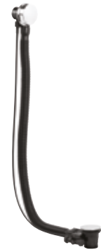
Pop-up Cable Bath Waste & Overflow 1020mm hose