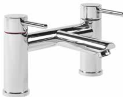
Lift Bath Filler Minimum recommended pressure 0.2bar 136(h) x 143(d)mm