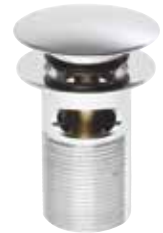
75mm Slotted Click Waste