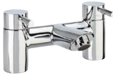
Kinetic Bath Filler Minimum recommended pressure 0.2bar 117(h) x 160(d)mm