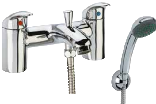
Cruz Bath Shower Mixer & Handset Minimum recommended pressure 0.1bar 127(h) x 160(d)mm