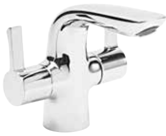
Revive Basin Mixer with Click Waste Minimum recommended pressure 0.2bar 165(w) x 120(h)mm