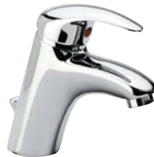
Cruz Basin Mixer (with pop up waste) Minimum recommended pressure 0.1bar 143(h) x 150(d)mm