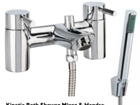
Kinetic Bath Shower Mixer & Handset Minimum recommended pressure 0.3bar 117(h) x 160(d)mm