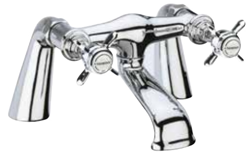
Varsity Bath Filler Minimum recommended pressure 0.1 bar 132(h) x 200(d)mm