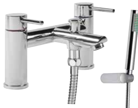
Lift Bath Shower Mixer & Handset Minimum recommended pressure 0.5bar 136(h) x 143(d)mm