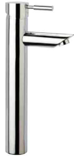
Kinetic Tall Basin Mixer (waste not included) Minimum recommended pressure 0.1bar 314(h) x 150(d)mm