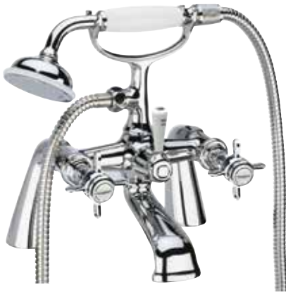
Varsity Bath Shower Mixer & Handset Minimum recommended pressure 0.1 bar 252(h) x 200(d)mm