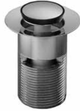
75mm Slotted Click Waste