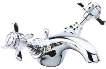
Varsity Basin Mixer (with pop up waste) Minimum recommended pressure 0.1 bar 100(h) x 140(d)mm