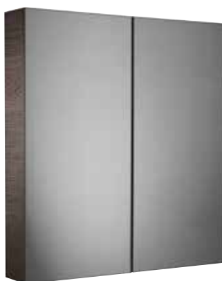
Observe Cabinet with Double Mirror Door Montana Gloss 600(w) x 650(h) x 115(d)mm