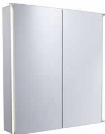
Sleek Double Door Cabinet with Integrated LED Lighting