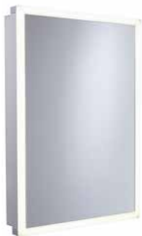
Nook Single Door Cabinet with Integrated LED Lighting