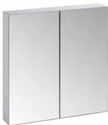
Observe Cabinet with Double Mirror Door Gloss White 600(w) x 650(h) x 115(d)mm