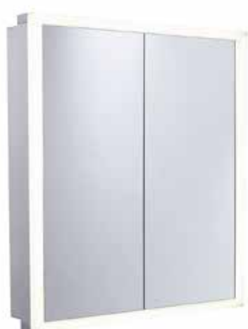
Nook Double Door Cabinet with Integrated LED Lighting