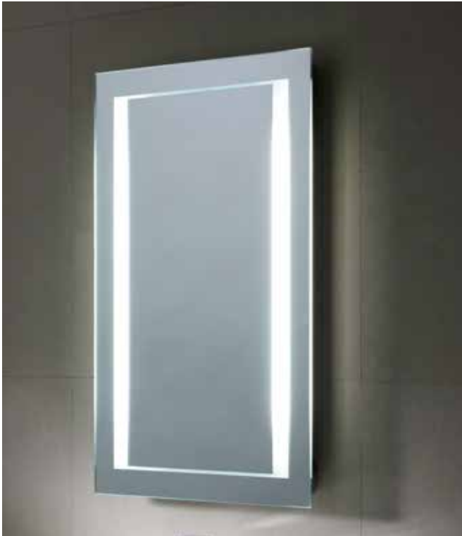
Align Illuminated Mirror 450(w) x 700(h) x 40(d)mm (2 x 13watts) Features: Rocker switch, IP44, Can be hung portrait or landscape