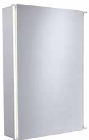
Sleek Single Door Cabinet with Integrated LED Lighting