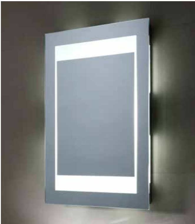
Transform Illuminated Mirror 600(w) x 800(h) x 50(d)mm (40 watts) Features: Ambient lighting, Heated demister pad, Infrared sensor, IP44, Can be hung portrait or landscape