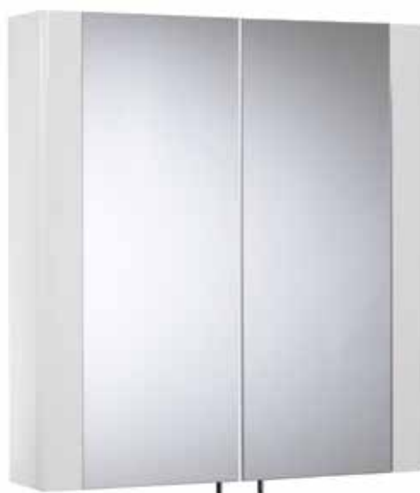
DE60W Detail Cabinet - Double Mirror Door, Gloss White 600(w) x 650(h) x 130(d)mm €266.01