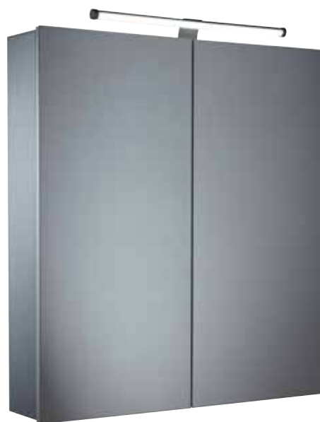
CO60AL Conduct Double Door Cabinet With Integrated LED Lighting 600(w) x 690(h) x 130(d)mm