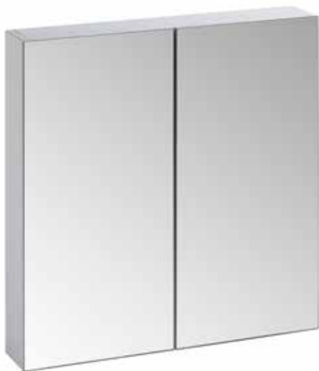
OB60W Observe Cabinet with Double Mirror Door gloss white finish 600(w) x 650(h) x 115(d)mm €216.09