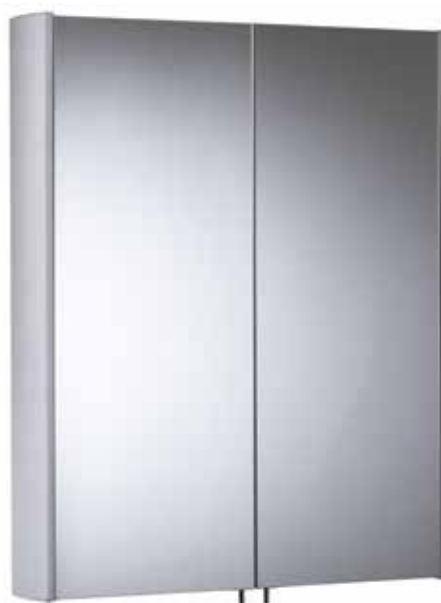
MO58AL Move Cabinet - Double Mirror Door 580(w) x 700(h) x 120(d)mm