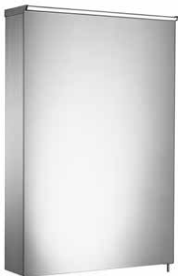
DY44AL Dynamic Single Door Cabinet With Integrated LED Lighting €529.04 440(w) x 650(h) x 130(d)mm