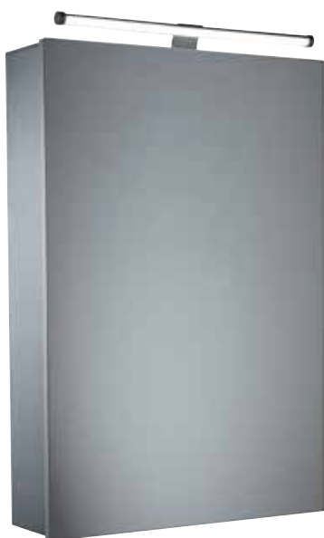
CO44AL Conduct Single Door Cabinet With Integrated LED Lighting 440(w) x 690(h) x 130(d)mm