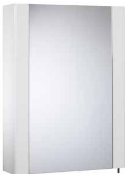
DE47W Detail Cabinet - Single Mirror Door, Gloss White 475(w) x 650(h) x 130(d)mm €210.87