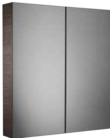
OB60M Observe Cabinet with Double Mirror Door montana gloss finish 600(w) x 650(h) x 115(d)mm €216.09