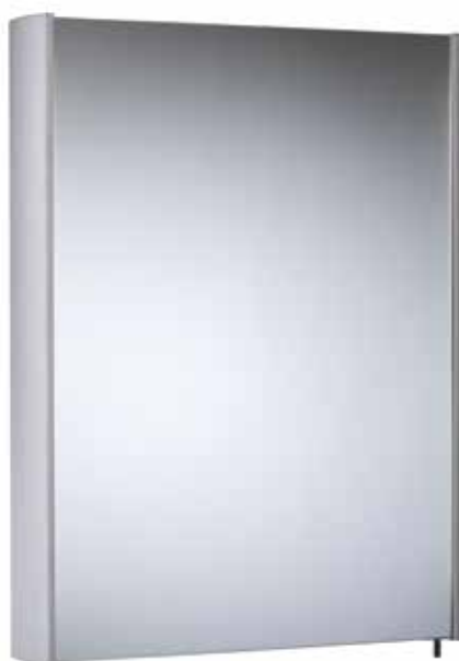
MO48AL Move Cabinet - Single Mirror Door 482(w) x 700(h) x 120(d)mm