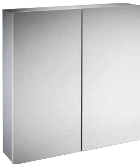
BA60AL Balance Cabinet - Double Mirror Door 600(w) x 650(h) x 130(d)mm