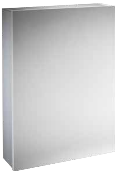
BA44AL Balance Cabinet - Single Mirror Door 440(w) x 650(h) x 130(d)mm