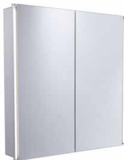
SL60AL Double Door Cabinet with Integrated LED Lighting €475.39 600(w) x 650(h) x 130(d)mm