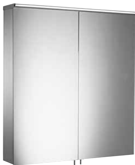
DY60AL Dynamic Double Door Cabinet With Integrated LED Lighting €625.90 600(w) x 650(h) x 130(d)mm