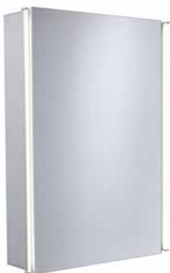
SL44AL Single Door Cabinet with Integrated LED Lighting €385.97 440(w) x 650(h) x 130(d)mm