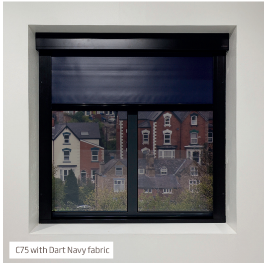
C75 with Dart Navy fabric