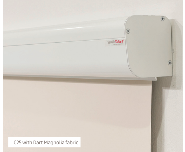
C25 with Dart Magnolia fabric

It's important for manufacturers and installers to find themselves a good PVC fabric supplier. PVC fabric's reliability, strength and complete blackout qualities make it a staple for any fabric range.