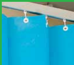
Disposable cubicle curtains