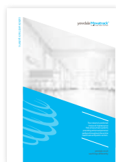
yewdale Movatrack® CUBICLE AND TRACK SYSTEMS