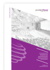
yewdale Vitesse® CURTAIN TRACK SYSTEMS