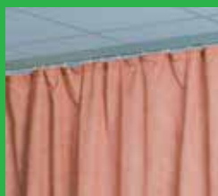
Ready-made cubicle curtains

On working wards, the emphasis on infection control means that curtains often have to be changed at short notice - so spare sets must be immediately to hand. This is leading to a complete reappraisal of the curtain stock situation - and YewdaleHarrier®, with its standard sizing and off-the-shelf capability is proving to be the answer.