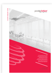
yewdale Defiant® FABRIC AND BLIND SYSTEMS