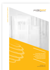
yewdale Kestrel® MAGNETIC ANTI-LIGATURE SYSTEM