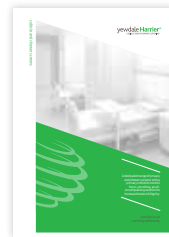
yewdale Harrier® CUBICLE AND SHOWER CURTAINS